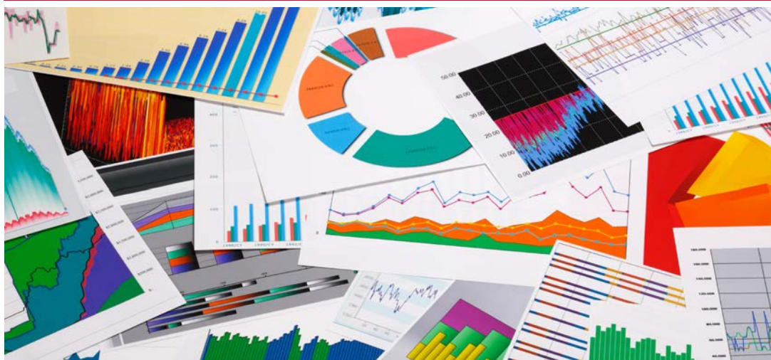
FIGURE IT OUT!